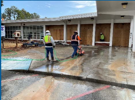
Saw-cutting Concrete for front vestibule area