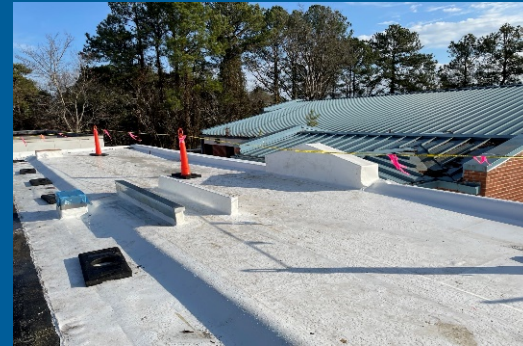
New TPO and HVAC Curb install