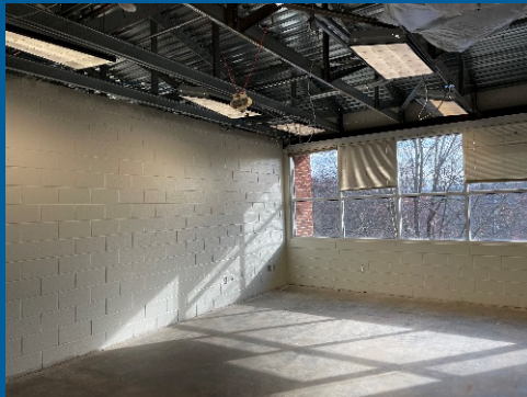
First Coat of finish paint in classrooms