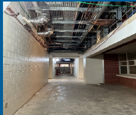
MEP Rough-ins being installed