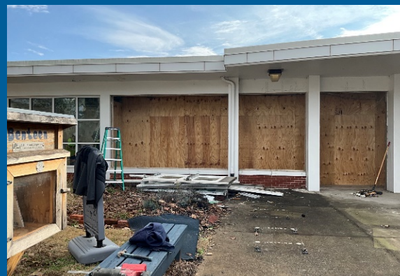
Storefront demolished for new vestibule addition